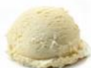
Plain vanilla ice-cream 1 large scoop