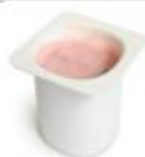
Low fat yoghurt 150 gram (1 small pot)