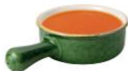
Tomato soup 200 gram (half a large tin)